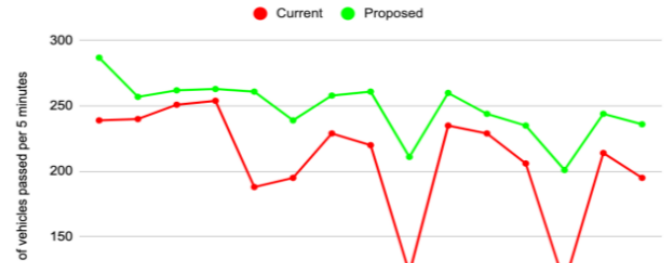
Figure 6: Comparison of current static system and proposed adaptive system

The simulations were conducted for a total of 1 hour 15 minutes, with 300 seconds i.e. 5 minutes for each distribution, with all simulation conditions being the same, and it was discovered that the proposed system fortified by about 23% on average when compared to the current system with fixed times. This means less time spent waiting for cars and less time spent idling at green signals. When these findings were compared to those of several other adaptive systems, it was discovered that the suggested system outperforms them. For example, [22] has a 70 percent accuracy, but the suggested method has an accuracy of 80 percent. When compared to static systems, reference obtains a performance gain of 12%, while the suggested system achieves a performance improvement of 23% [23].