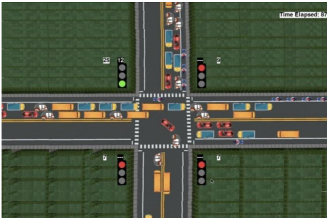
Figure 4: Simulation output

To imitate real-life traffic, a simulation was created from the ground up using Pygame. It helps in conceptualizing the process and compares it to a static system that already exists. It has a four-way junction with four traffic lights. On atop of every signal is a timer that displays the amount of time before the signal changes. The amount of vehicles that already have crossed the junction is also shown next to each light. Automobiles, bicycles, vans, trucks, and rickshaws arrive from all directions. Some of the cars in the right-hand column move to cross the junction to keep the scenario more realistic. When a vehicle is produced, random numbers are used to determine whether it will turn or not. It also has a timer that shows how much time has passed since the simulation began. Figure 4 depicts a glimpse of the simulation's ultimate outcome.